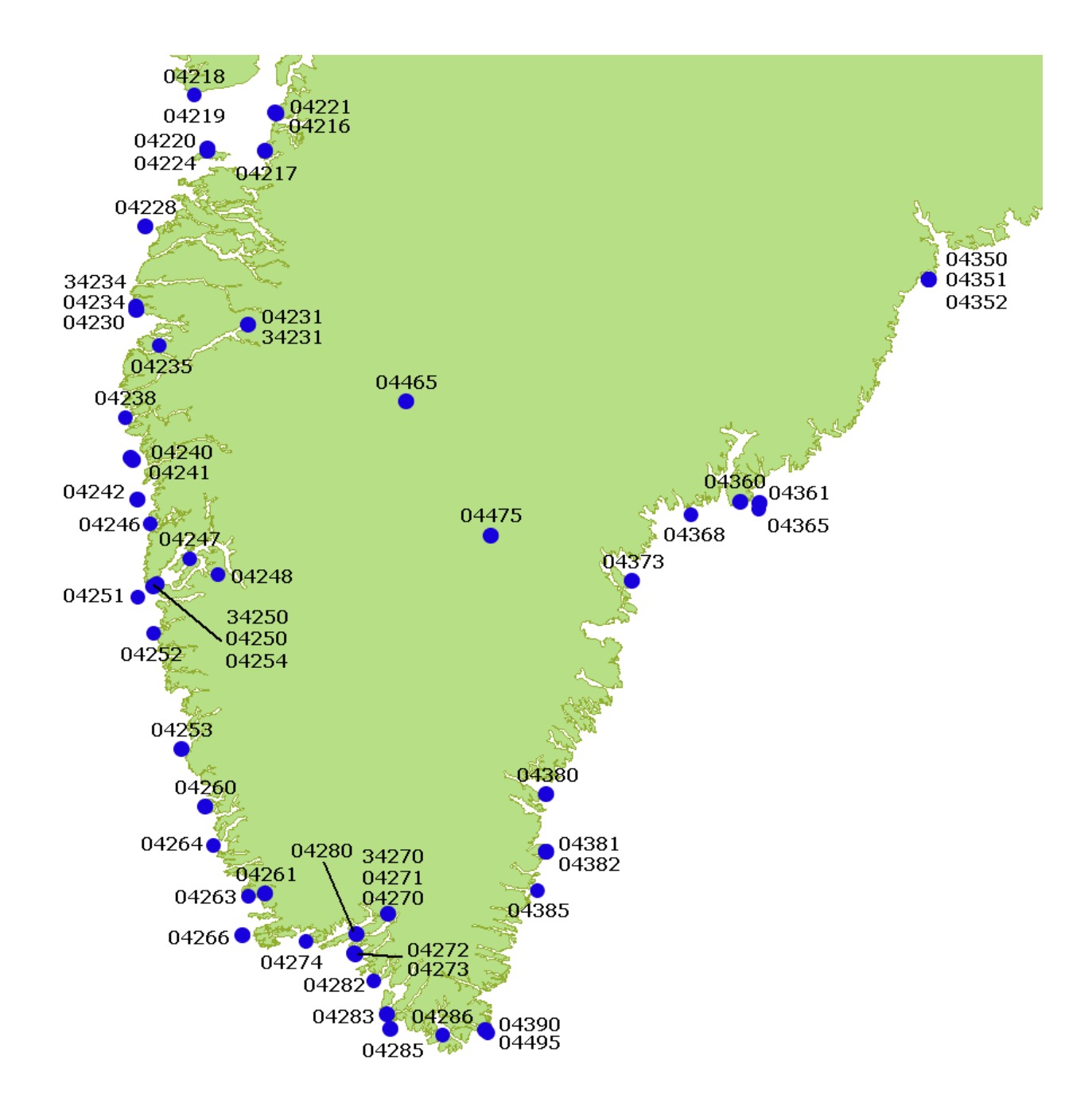
Figure 2. Station positions, Southern Greenland. See figure 1 for a map of Greenland as a whole (graphics M. Scharling). The official WMO station identifier for Greenland consist of 5 digits "04xxx". On the map the station identifiers "04xxx" are used. The national station identifiers describing manual precipitation stations in Greenland consist of 5 digits "34xxxx", also used on the map. These identifiers with five digits are used in the "old" data sets before 2014, where the in front "0" is omitted i.e. "4250" for Nuuk. In the "new" data sets "00" is added to all station identifiers, so they consist of 6 digits i.e. 425000 for Nuuk. Concerning the national station identifiers "50" is added to the station identifiers in the "new" data sets, so they consist of 7 digits i.e. 3423450 for Sisimiut.