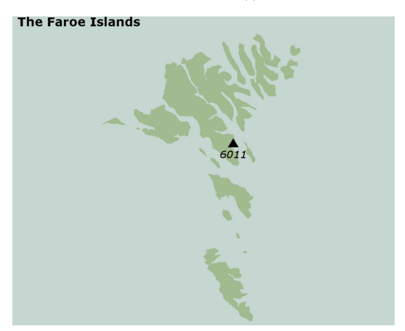
Figure 1: Map of the Faroe Islands including the location of the weather station 6011 Tórshavn. The 4-digit station identifier is an old version of the current 6-digit station identifier 601100.

The position of the weather station Tórshavn can be seen below in Figure 1. Information about the station such as coordinates can be found in Appendix 1 – Station Details.