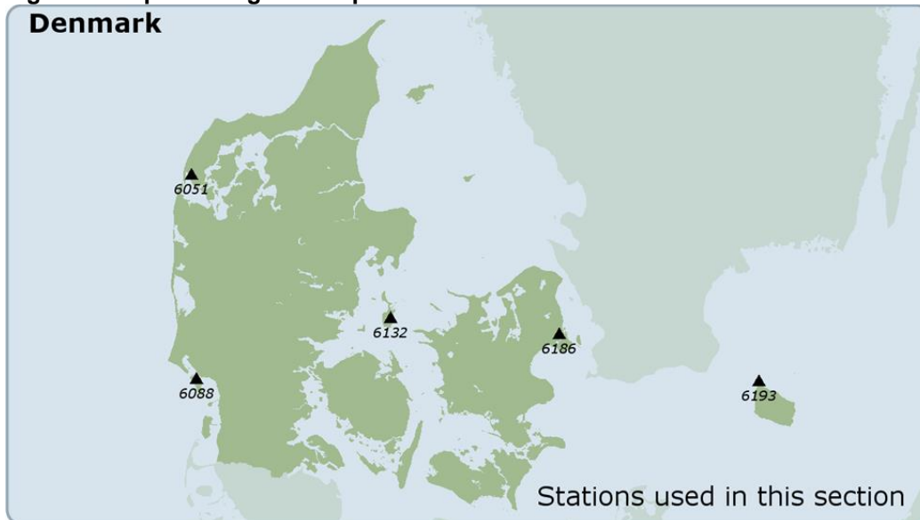
Figure 1. Map showing station position of the stations in Denmark referred to in this report.

Figure 1 note: The official WMO station identifiers for Denmark consist of 5 digits “06xxx”. However, in this report the in front “0” is omitted, giving 4 digits i.e. “6132” for Tranebjerg, which is also used on the map. See more in section 5 – Station history.