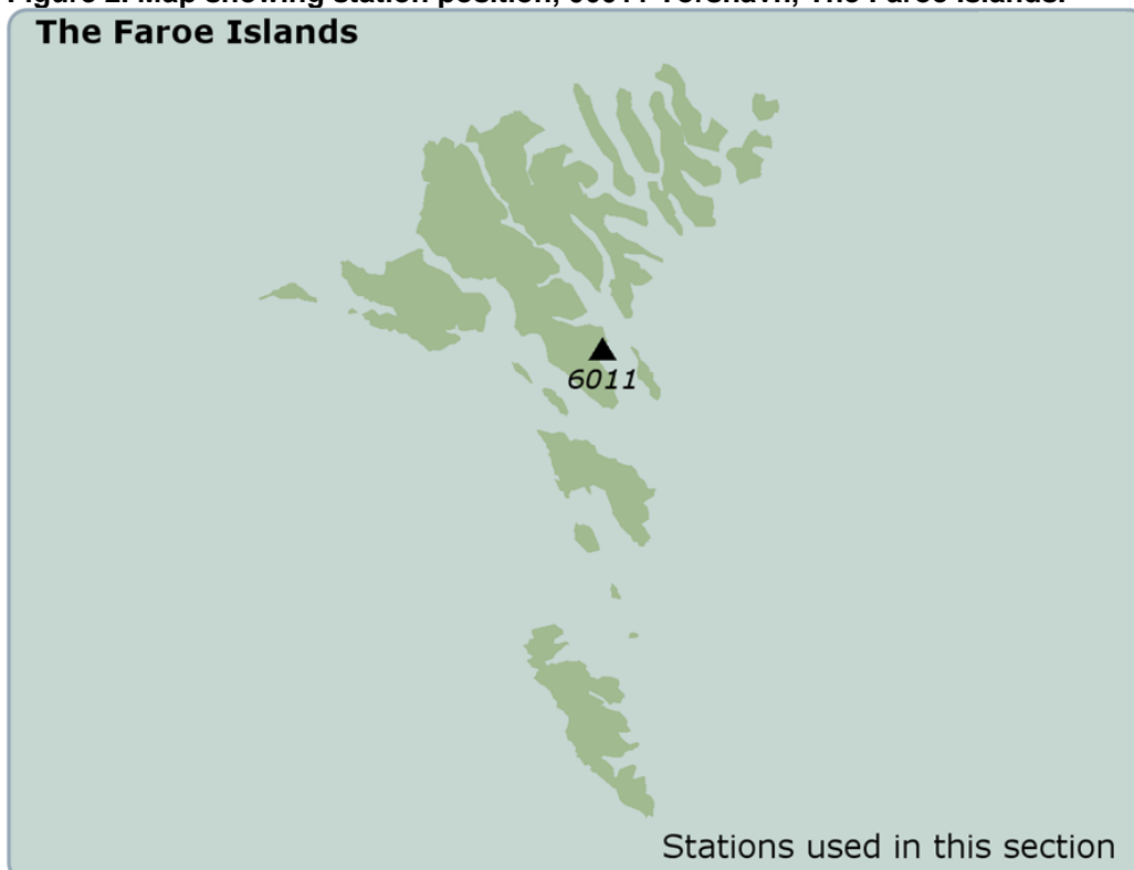
Figure 2. Map showing station position, 06011 Tórshavn, The Faroe Islands.

Figure 2 note: The official WMO station identifier for Tórshavn consists of 5 digits “06011”. However, in this report the in front “0” is omitted, giving 4 digits i.e. “6011” for Tórshavn, which is also used on the map. See more in section 5 – Station history.